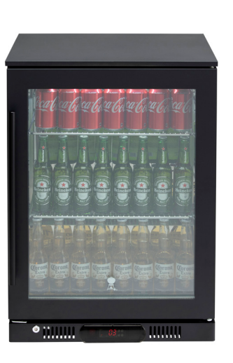
WF600BKR - RIGHT HAND SIDE HINGE (Door handle on the left side)