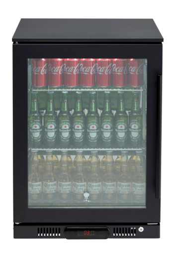
WF600BKL - LEFT HAND SIDE HINGE (Door handle on the right side)

PRODUCT CODE: WF600BKL (Left Hand Side Hinge) WF600BKR (Right Hand Side Hinge)